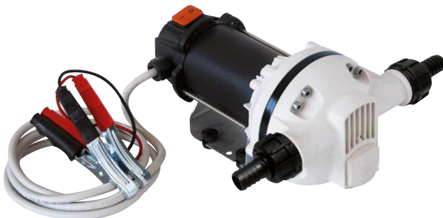
SUZZARABLU PUMP DC